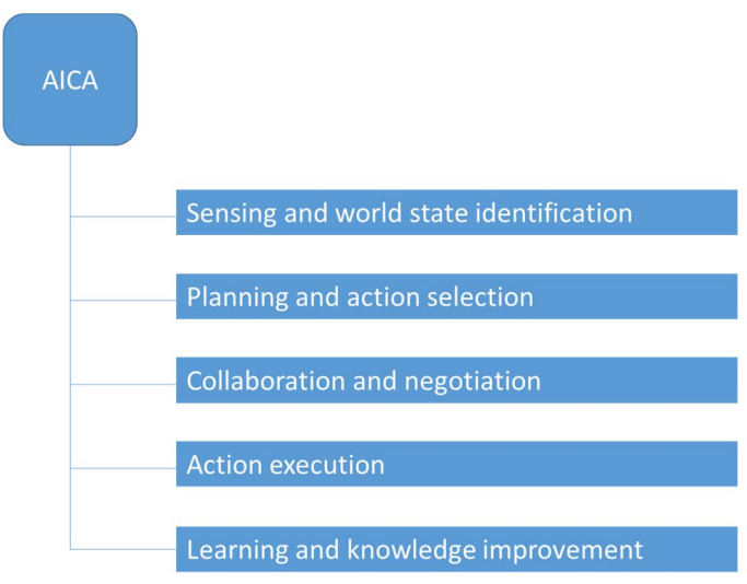
Figure 2 The AICA's main five high-level functions